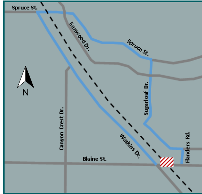
Closure: Blaine Street Detour Route: Watkins Drive, Spruce Street and Sugarloaf Drive