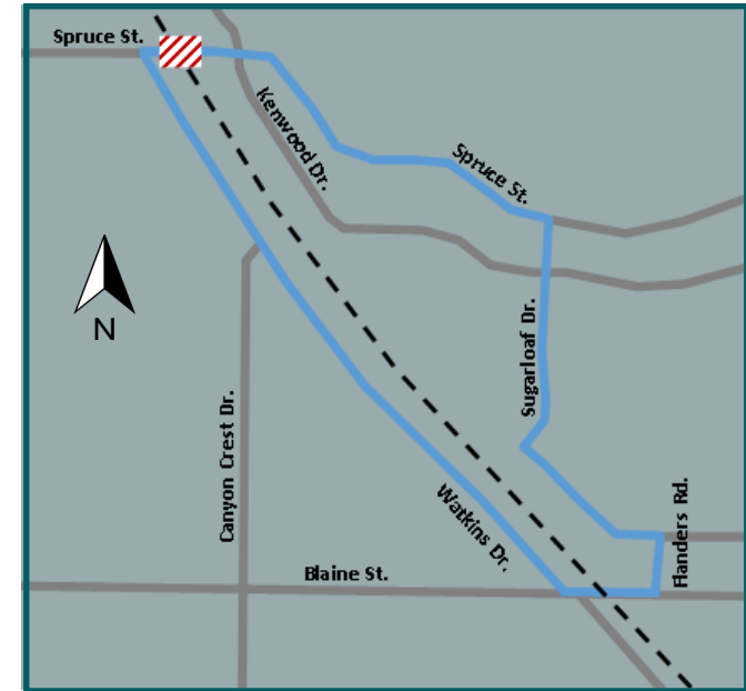
Closure: Spruce Street Detour Route: Watkins Drive, Flanders Road, Sugarloaf Drive and Spruce Street