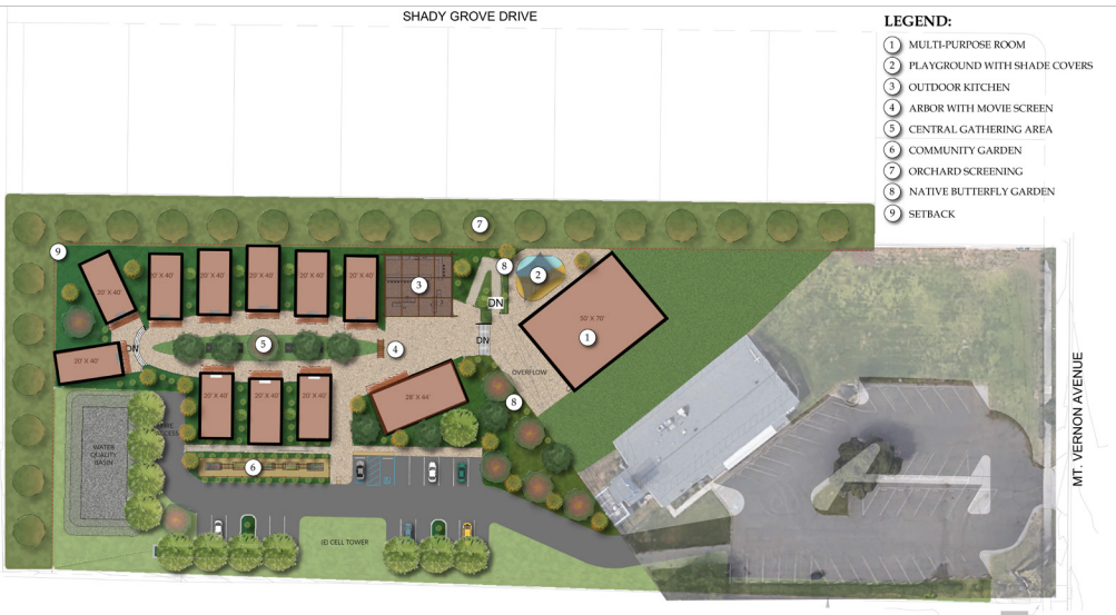
Conceptual Landscape Plan — Crest Cottages

Once the building plans are finalized and the funds are raised, the Crest Cottages will provide this safe, stable, and supportive program for as many as 16-24 participants at a time, giving each the opportunity to be pulled out of crisis and wrapped in a supportive and loving community of care.