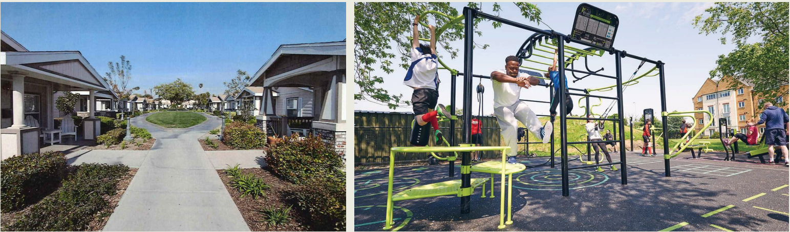
Conceptual Images of Crest Cottage Village

This transformational Crest Cottage Village will require philanthropic investments from forward looking donors and friends to achieve its $2.8 million, plus a $1 million facility endowment that will allow for maintenance and up-keep. We invite you to join us in this life changing initiative.