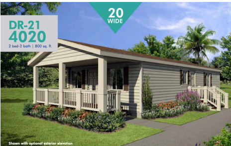
Example Home Exterior

Once the building plans are finalized and the funds are raised, the Crest Cottages will provide this safe, stable, and supportive program for as many as 16-24 participants at a time, giving each the opportunity to be pulled out of crisis and wrapped in a supportive and loving community of care.